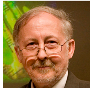
Busa Award July 18, 2013 3:30pm

eastern University in Boston and a master’s degree from the Simmons College of Library and Information Science, also in Boston. After serving in the Navy during the Vietnam War, he started in the humanities library at MIT, where he worked for 31 years, rising to associate director for public services and acting co-director of libraries.