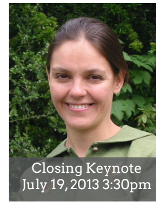
Closing Keynote July 19, 2013 3:30pm